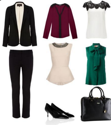
Picture: Western Business Attire for Women

A dress of standard length for business attires, (you might also want to wear pantyhose or tights with it), blazers, and formal pants. Wearing high heels is advised but completely optional.