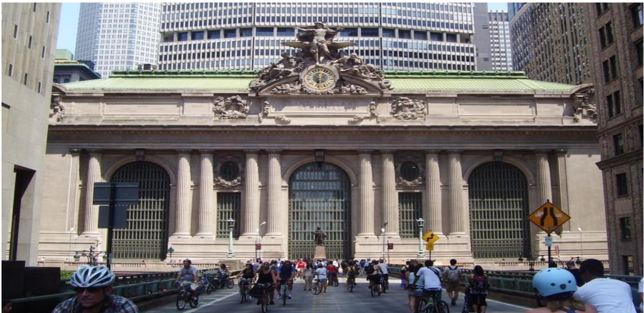
Picture: Grand Central Station, Front View.

The Subway system may be used to get there. Take the subway trains (4, 5, 6, or 7) to Grand Central Station. You can either take the bus or walk 15 – 20 mins East on 42 nd Street to 1st Ave. While you will be already in front of the UN, you will be then need to go to the security checkpoint located on the 45 th Street.