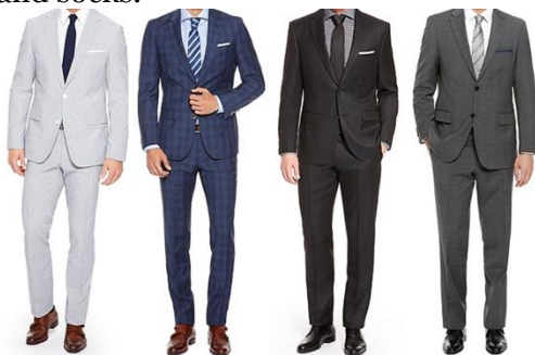
Picture: Western Business Attire for Men

Western Business Attire for men most often entails wearing a suit, which may be composed by two or three pieces: trousers, a matching jacket, a button down shirt and a tie, and a vest (optional). You should also consider pairing your suit with modest, conservative dress shoes and socks.