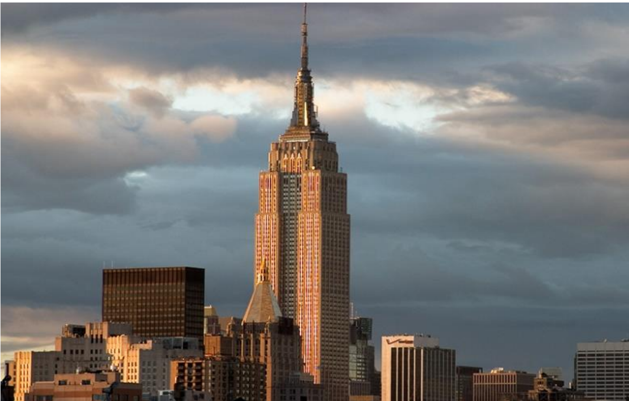
The Empire State Building. Note: Additional Ticket Price for Access to the ESB observatory is not included in prepaid social package.